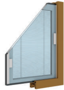
Manual DG Venetian Blind