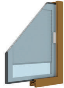
Manual DG HoneyComb Blind