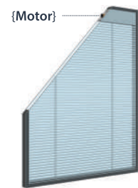
Motorised DG Blind (common for both the venetian & honeycomb variants)